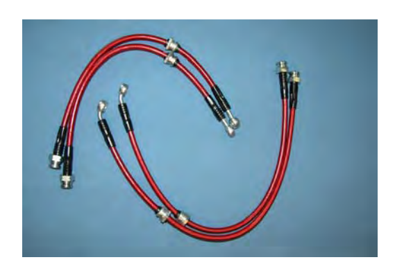
<u>Installation Instructions for CorkSport Braided Brake Line Kit</u>

<u>Warning:</u> Installation of the brake lines should be done by a professional mechanic. By following the instructions below you are accepting all responsibility for the installation. CorkSport nor any of its employees or owners will not be liable for the faulty installation from following these instructions. The installation instructions are for reference only.