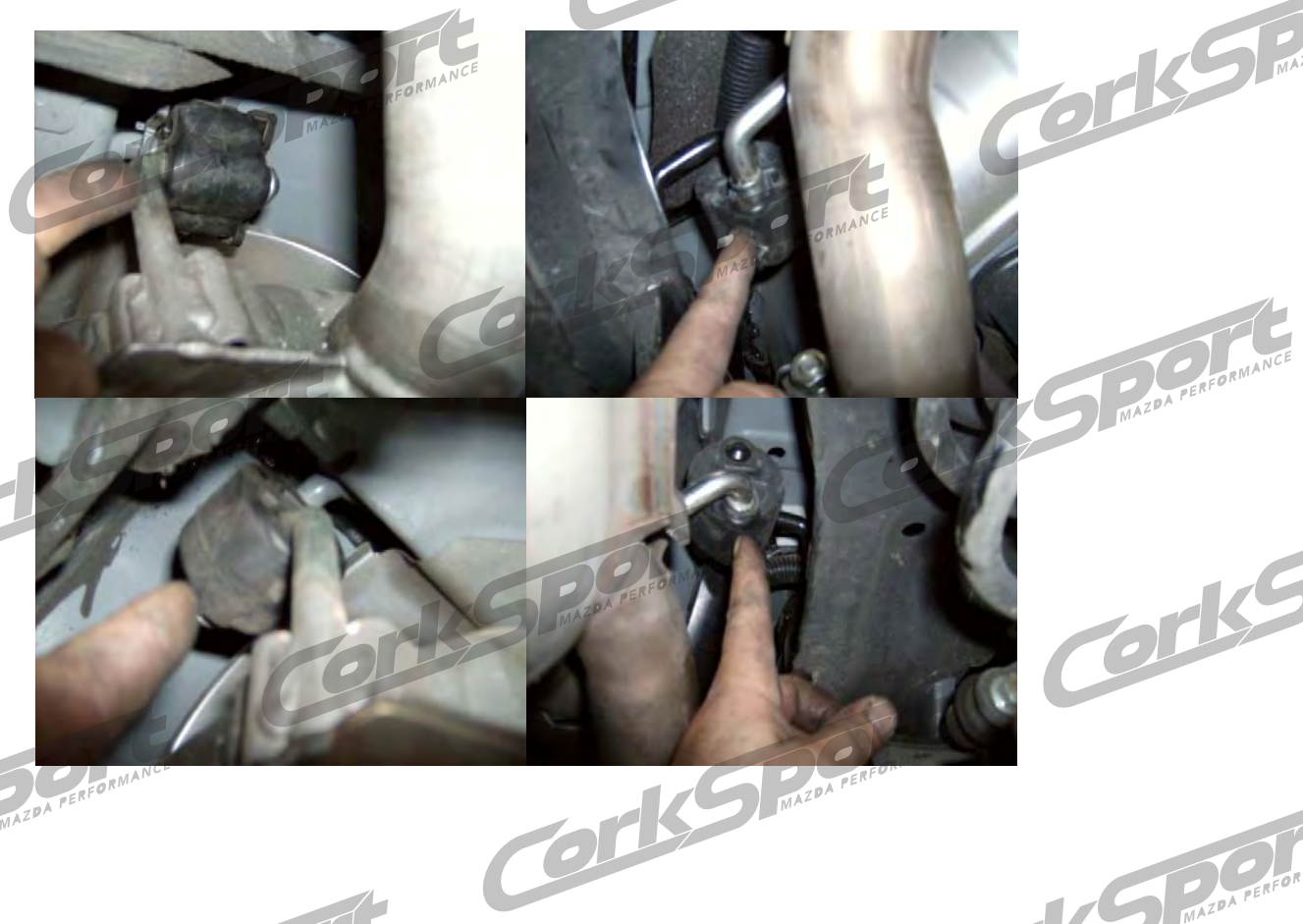
Step 6: Remove the mid exhaust section from the exhaust hangars and then from the car.