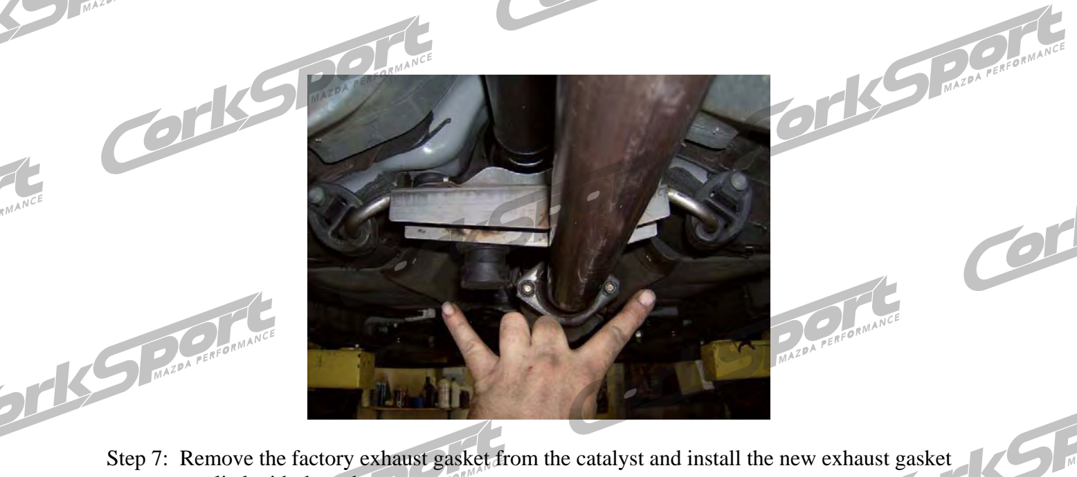
supplied with the exhaust system.