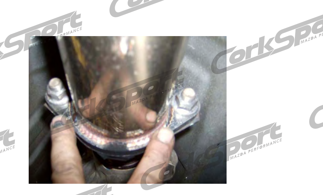
Step 10: Install the middle section to the front section of the exhaust system using two 17mm bolts, four washers, and two 17mm headed nuts.

Step 11: Install the new muffler sections into the exhaust hangars and to the mid pipe with the four 17mm headed bolts, eight washers, and four 17mm headed nuts. Leave the nuts and bolts hand tight.