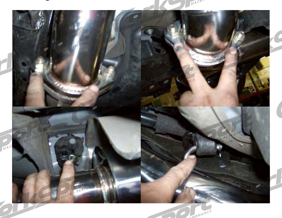
Step 12: Double check clearances with the rear mufflers and the bezels in the bumper valence to make sure everything it centered properly and tighten the nuts and bolts at the muffler to mid pipe flanges.

Step 11: Install the new muffler sections into the exhaust hangars and to the mid pipe with the four 17mm headed bolts, eight washers, and four 17mm headed nuts. Leave the nuts and bolts hand tight.