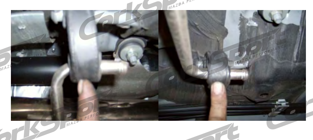
Step 9: Re-using the two 17mm headed nuts bolt down the front section to the catalyst.