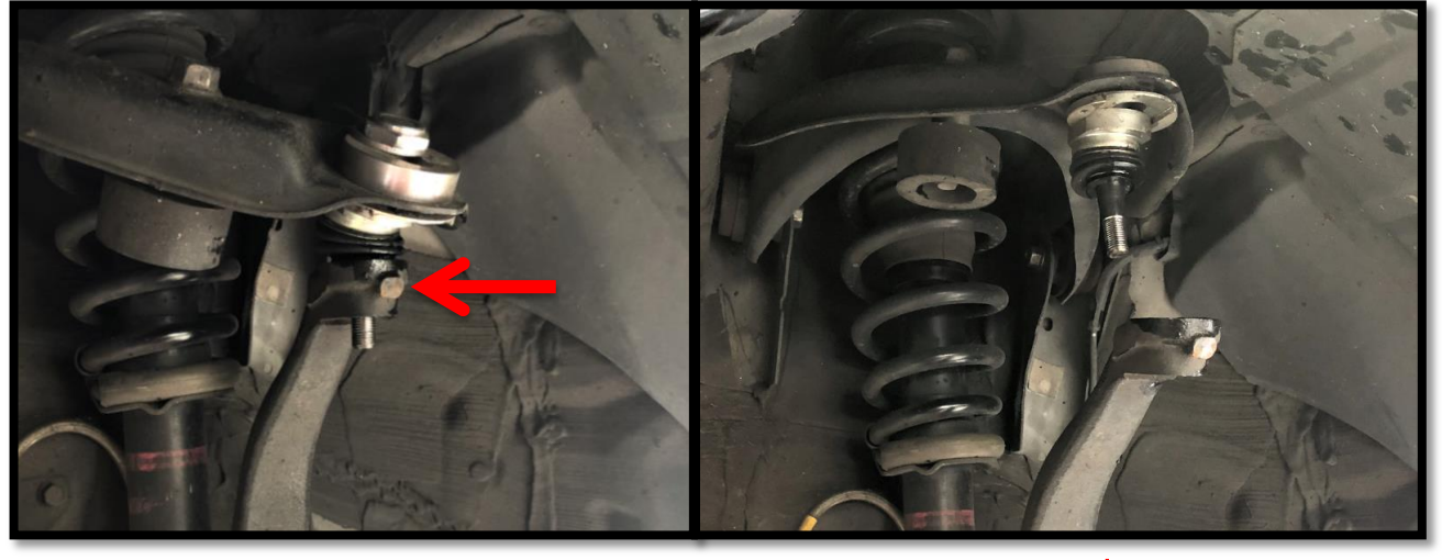
Figure 1c Figure 1d