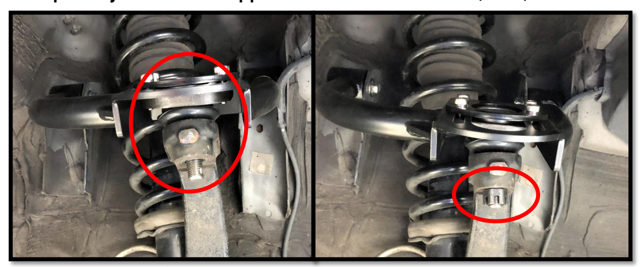
Figure 2b Figure 2c

e) Secure the ball joint into the knuckle with the supplied castle nut. Tighten to 35ft-lbs. Shown completed in Figure 2c.