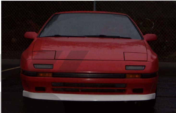
Installation instructions for the CorkSport 'Type CS' Series 4 Rx7 Front Lip