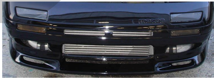
Installation instructions for the CorkSport 'ODURA' Lip 4 Rx7 Front Lip

Thank you for your purchase. If you have any questions please call Cork Sport at 360 260 CORK