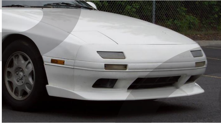
Installation Instructions for the CorkSport Type "MS" Lip for 89-91 RX-7