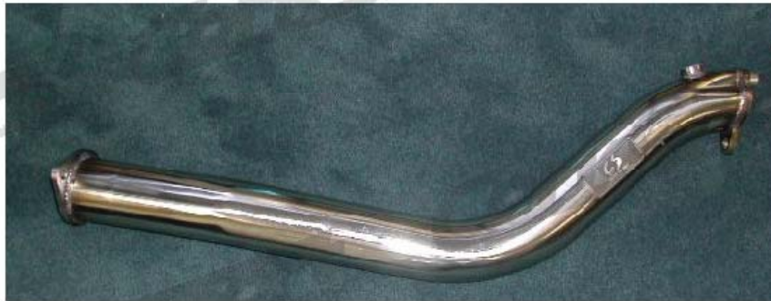
CorkSport Power Series Down Pipe for the 87-91 RX-7 TurboII Install Instructions