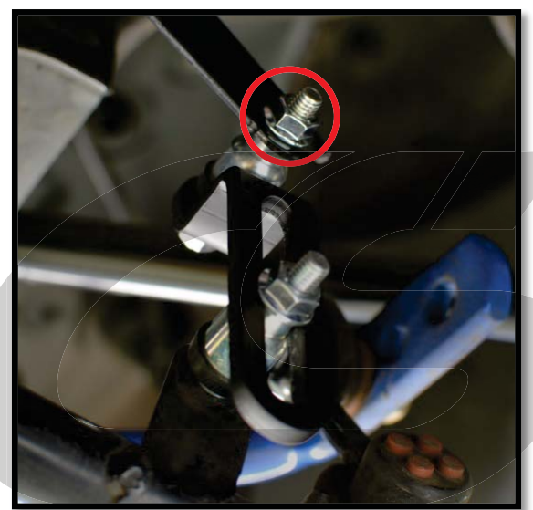
Figure 2a Figure 2b