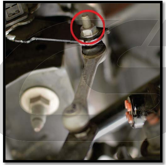
Figure 1a Figure 1b