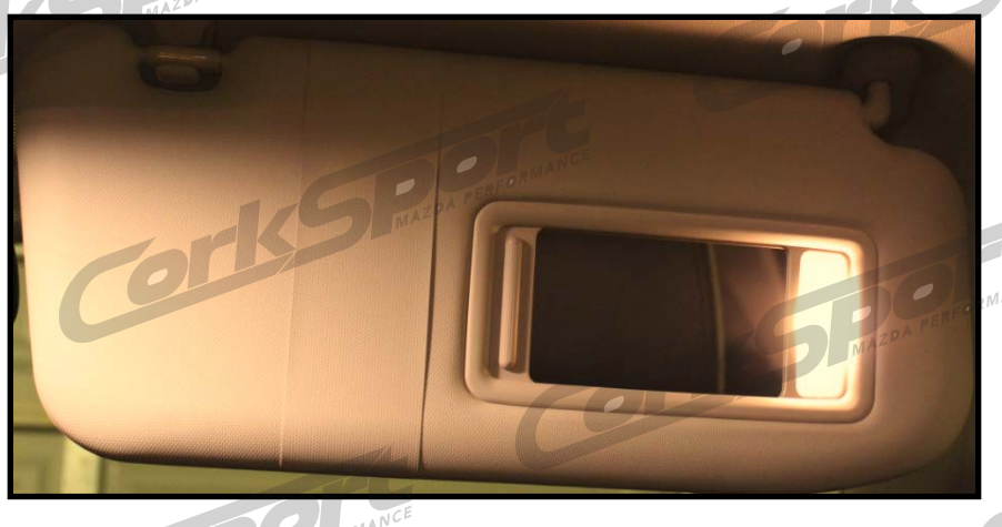
Figure 5a Need Help With Your Installation? Call (360) 260-CORK