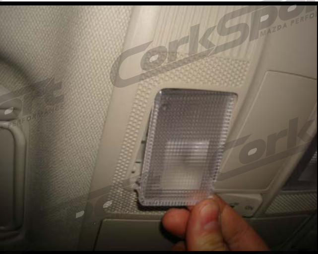
Need Help With Your Installation? Call (360) 260-CORK